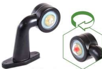
DLGO01.4 (9.180) height 95 mm / 2 LED