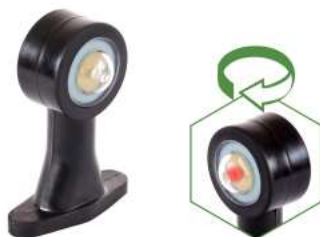
DLGO01.1 (9.120) height 102 mm / 2 LED