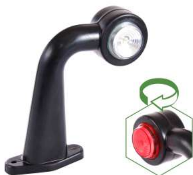
DLGO02 (10.100) height 150 mm / 2 LED