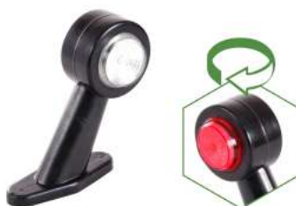
DLGO02.5 (10.200) height 95 mm / 2 LED