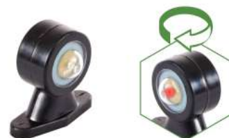
DLGO01.2 (9.140) height 60 mm / 2 LED