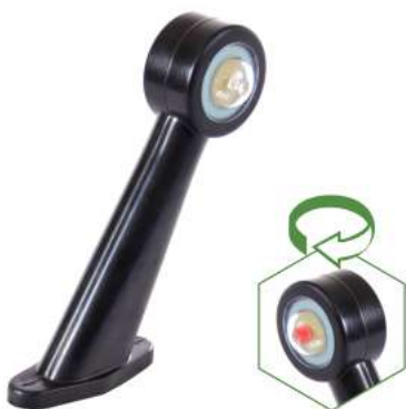
DLGO01.3 (9.160) height 160 mm / 2 LED