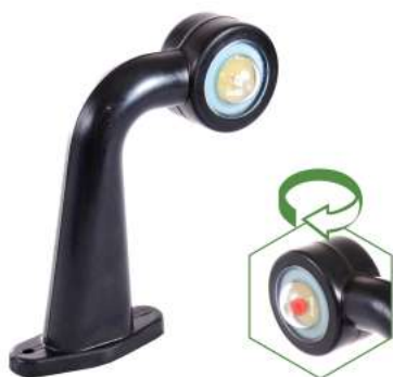
DLGO01 (9.100) height 150 mm / 2 LED