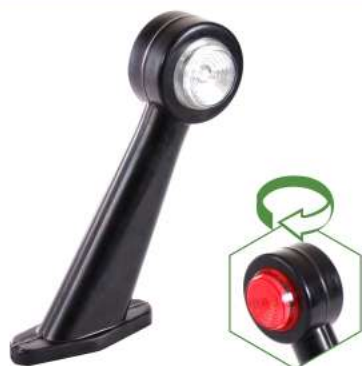
DLGO02.3 (10.160) height 160 mm / 2 LED