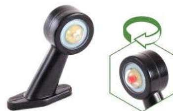
DLGO01.5 (9.200) height 95 mm / 2 LED