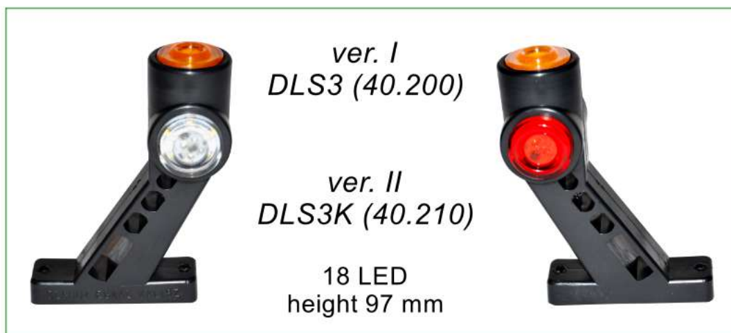
ver. I DLS3 (40.200)