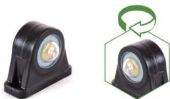
DLGO01.6 (9.220) height 47 mm / 2 LED