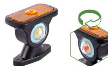
DLGO01.7.1 (9.260) height 60 mm / 3 LED

WHITE LIGHT CAT. A | YELLOW LIGHT CAT. SM1 | RED LIGHT CAT. R | REFLECTOR CAT. IA | IP 68 RUBBER HOUSING | 9-33 V