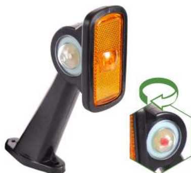
DLGO01.7 (9.240) height 160 mm / 3 LED