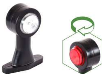
DLGO02.1 (10.120) height 102 mm / 2 LED