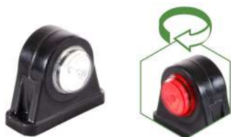
DLGO02.6 (10.220) height 47 mm / 2 LED