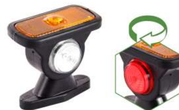
DLGO02.7.1 (10.260) height 60 mm / 3 LED

WHITE LIGHT CAT. A | YELLOW LIGHT CAT. SM1 | RED LIGHT CAT. R | REFLECTOR CAT. IA | IP 68 | RUBBER HOUSING | 9-33 V