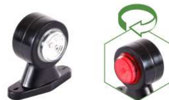
DLGO02.2 (10.140) height 60 mm / 2 LED