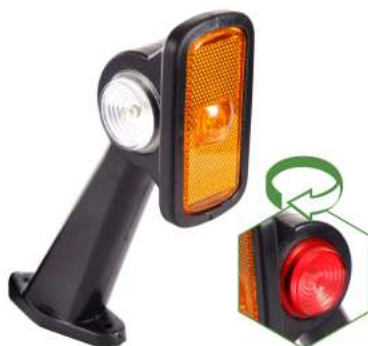
DLGO02.7 (10.240) height 160 mm / 3 LED