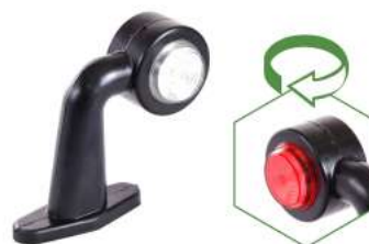
DLGO02.4 (10.180) height 95 mm / 2 LED